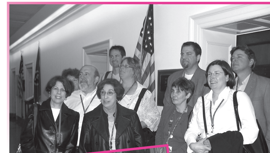
NTA Officers and Delegates recently attended the NYSUT Representative Assembly in Washington, D.C. There they visited the U.S. Capitol and are seen above at the office of U.S. Congressman John Hall.